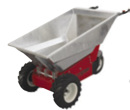
Galvanized Steel Tub