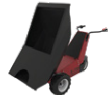
Slurry Tub w/Concrete Funnel Cap