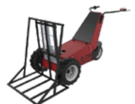
Tree & Boulder Dolly