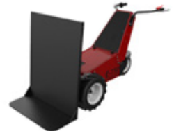
Dolly Transport Bed