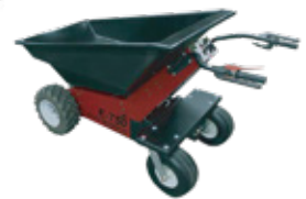
Option: Dual Landscaping Caster Wheels