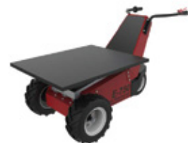
Flatbed - 2 sizes Short: 31" W x 38" L Long: 31" W x 48" L